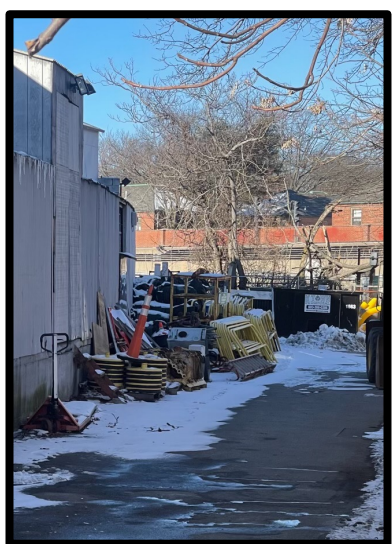
Small backyard outdoor storage area