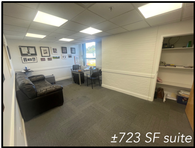
±723 SF suite